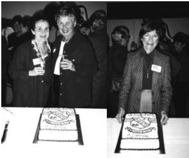
Class of '44 — 60th Anniversary