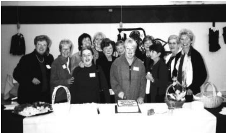
Class of '56