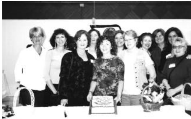
Class of '74 — 30th Anniversary