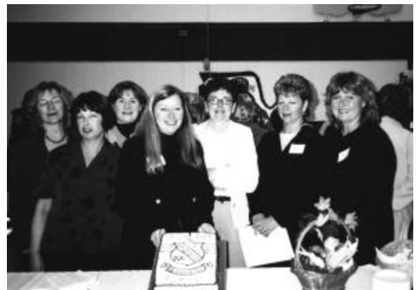
Class of '72