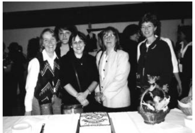
Class of '79 — 25th Anniversary